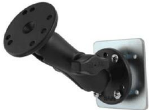
RAM1" Double Ball Mount with Backing Plate